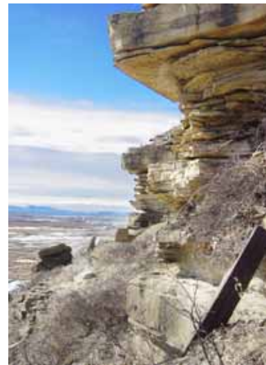
Right: Ulm Pishkun