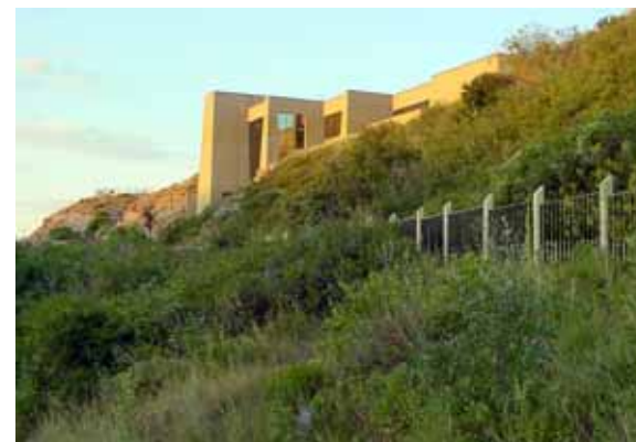
Below: Lewis & Clark Interpretive Center